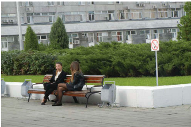
FIGURE 3 Legal nihilism? Russian students at People's Friendship University smoking next to a no-smoking sign.

The September survey polled 310 students, the December survey 238 students. Demographically, the two surveys were similar. Fifty-seven percent of respondents in the September survey were male compared with 55 percent in the December survey; the average age of September respondents was 20.0 compared with 20.3 among the December respondents. Approximately 80 percent of respondents in the September survey were smokers, defined