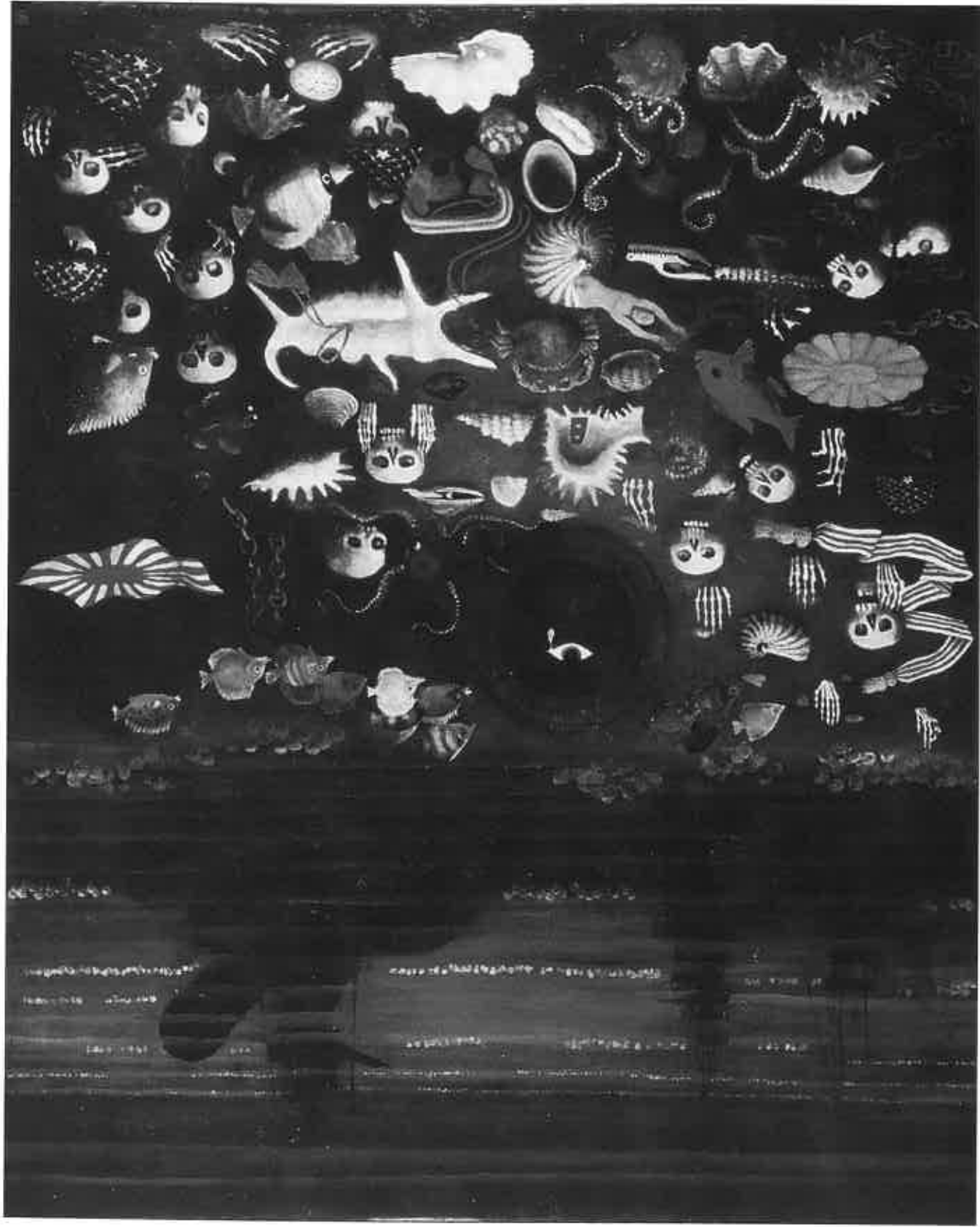
On the South Pacific Ocean Floor.

Tomiyama had deliberately set out "to speak for those whose experience had been silenced by modern history," finding a surer voice for herself in the process.