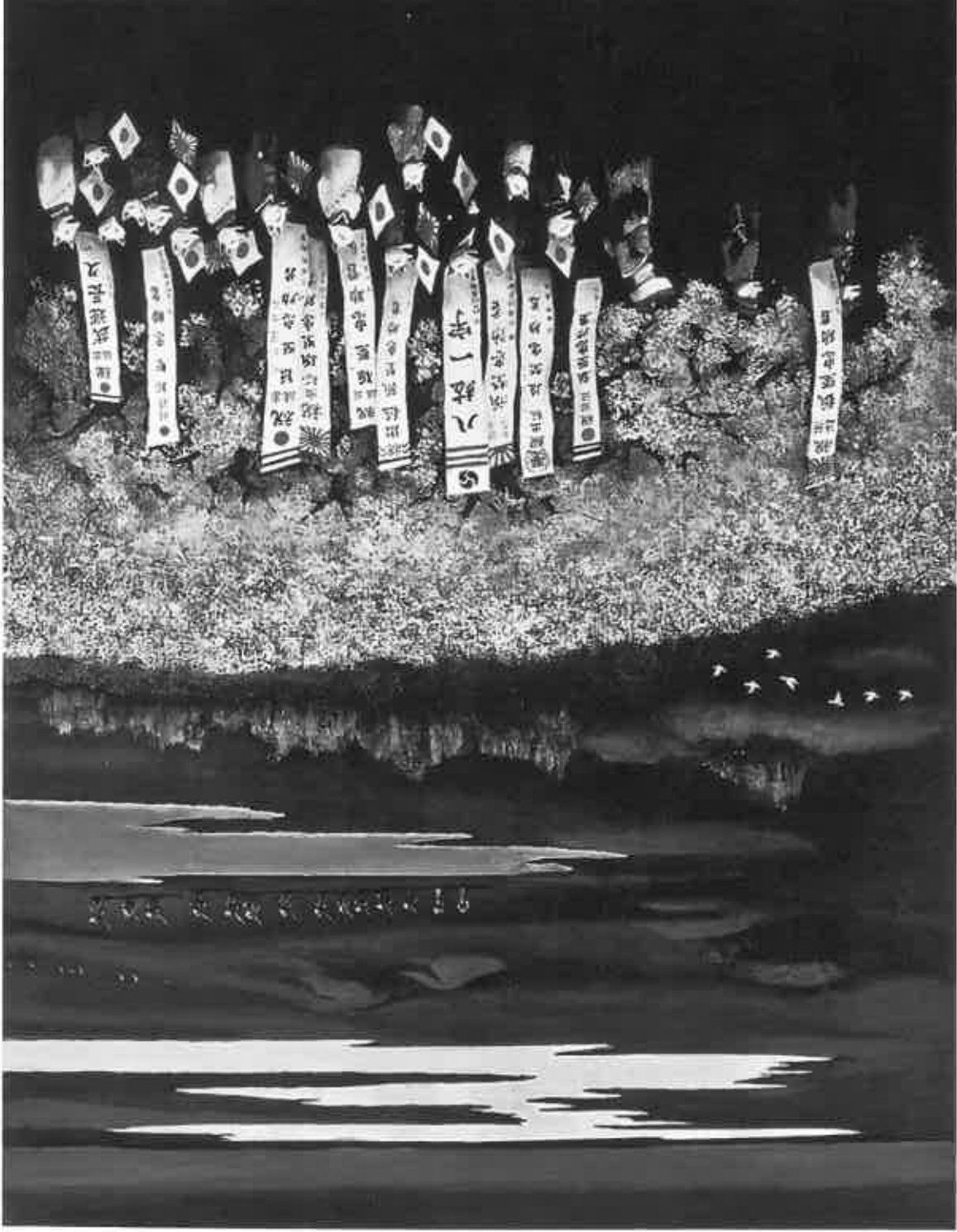
Illusion by Cherry Blossom .

Tomiyama is also deliberately countering the aesthetics of Japanese fascism, particularly the way that the wartime Japanese government used cherry blossoms to celebrate its subjects who died young for the nation. The marriage ceremony continues in Illusion by Cherry Blossom , which shows the wedding party under a row of cherry trees in full blossom. The foxes dance and parade under the trees and hide among