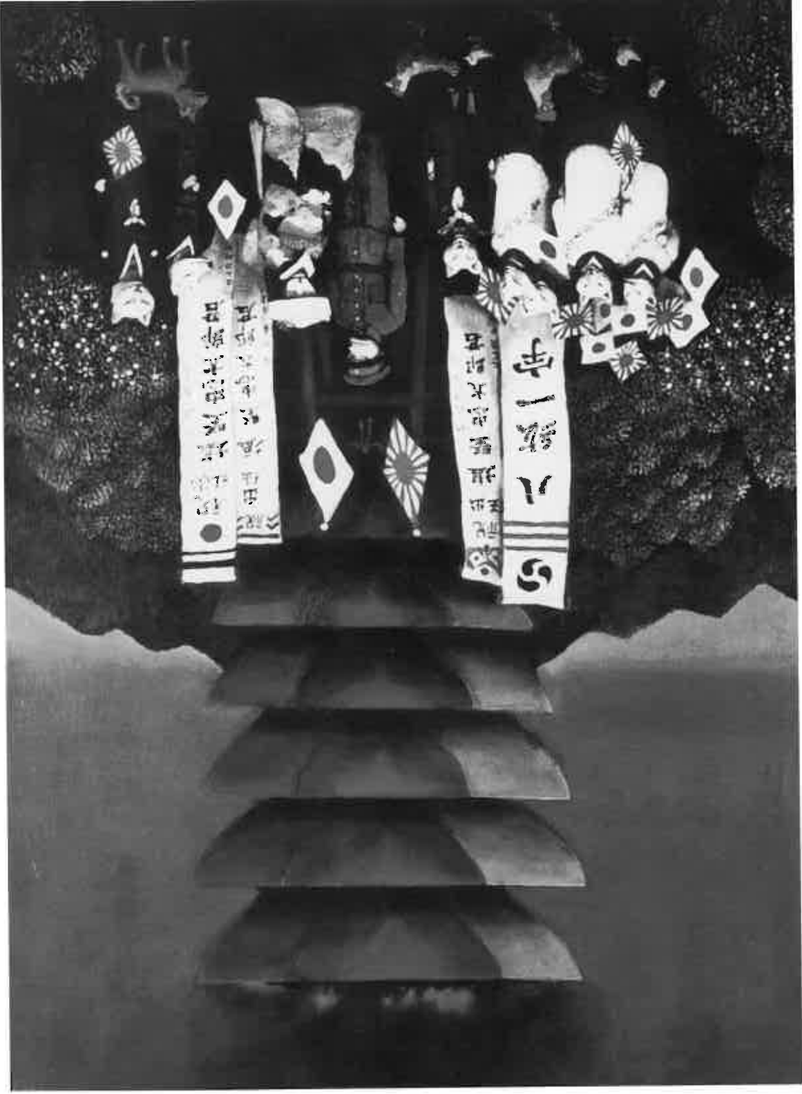
Sending Off a Soldier