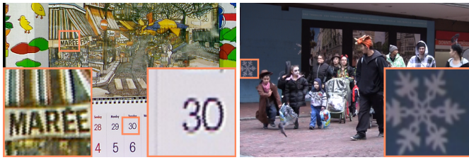
(a) Ground Truth