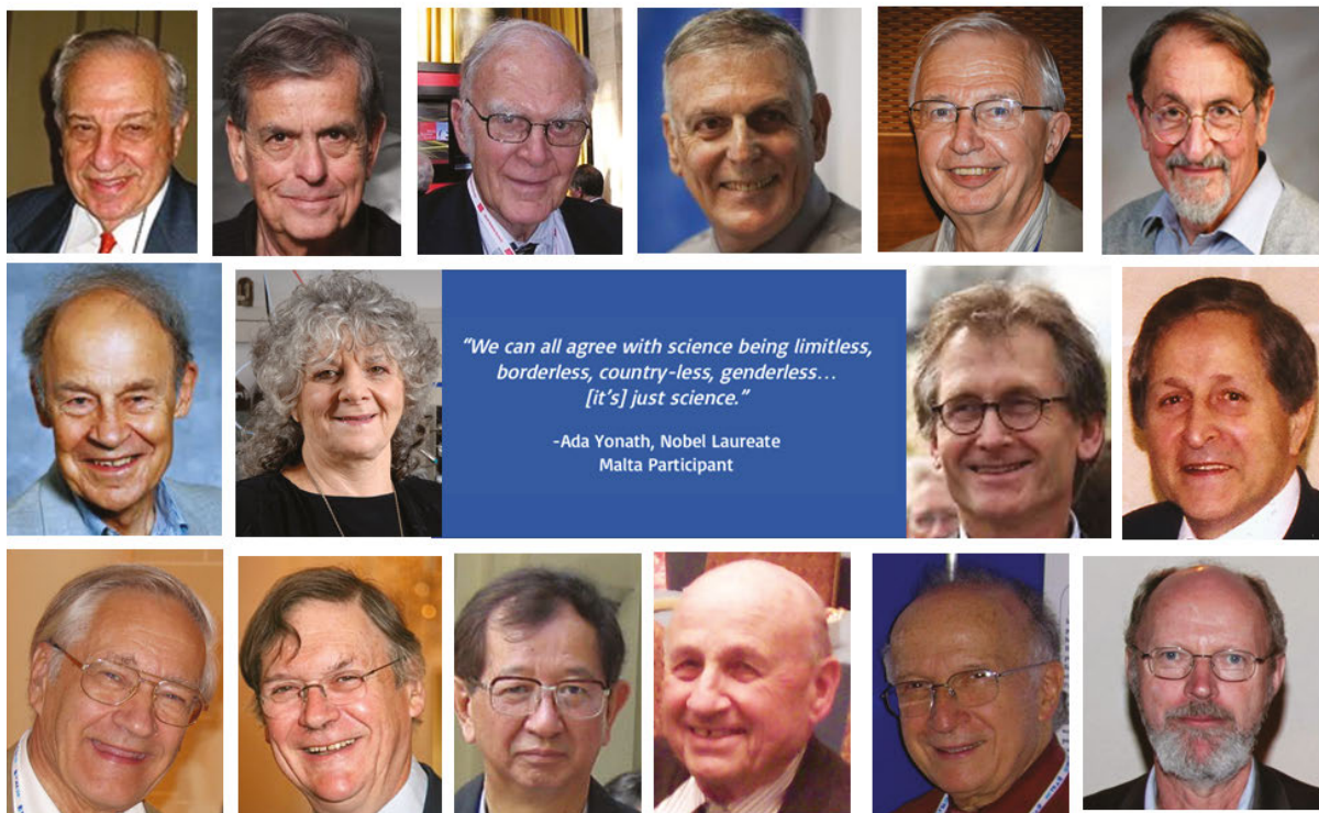
1. Rudolph A. Marcus (1992, Chemistry), 2. Aaron Ciechanover (2004, Chemistry), 3. F. Sherwood Rowland (1995, Chemistry), 4. Danny Shechtman (2011, Chemistry), 5. Jean-Marie Lehn (1987, Chemistry), 6. Martin Karplus (2013, Chemistry), 7. Dudley R. Herschbach (1984, Chemistry), 8. Ada E. Yonath (2009, Chemistry), 9. Ben L. Feringa (2016, Chemistry), 10. Claude Cohen-Tannoudji (1997, Physics), 11. Richard R. Ernst (1991, Chemistry), 12. Tim Hunt (2001, Physiology or Medicine), 13. Yuan T. Lee (1986, Chemistry), 14. Walter Kohn (1998, Chemistry), 15. Roald Hoffmann (1981, Chemistry), 16. Robert H. Grubbs (2005, Chemistry)