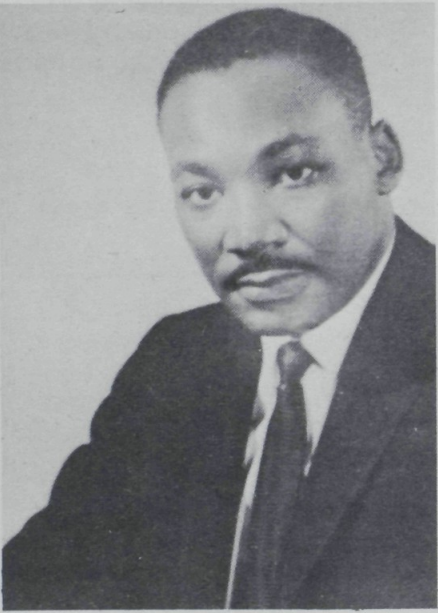
MARTIN LUTHER KING Slain in Memphis