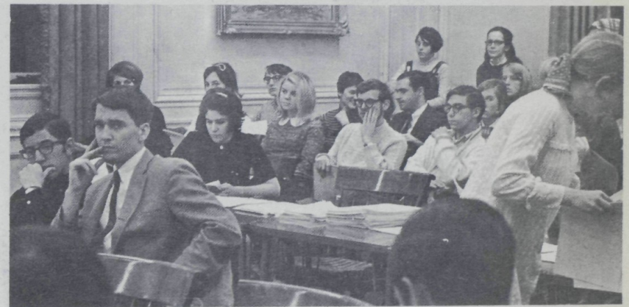
Representatives from 45 living units attended the Student Senate meeting on student autonomy last night. Twenty-four of the units requested and were granted autonomy by senate. Most of the unit representatives stayed for the entire two-and-a-half hour meeting.