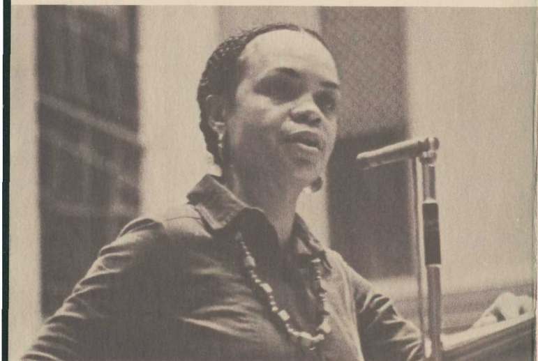
Sonia Sanchez, poet, playwright and lecturer, is keynoter for Black History Week.